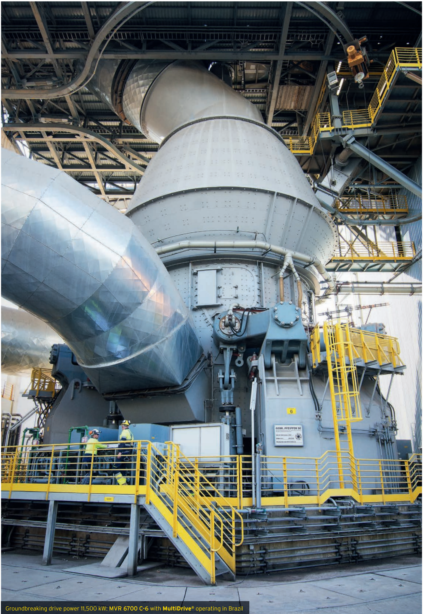
Groundbreaking drive power 11,500 kW: MVR 6700 C-6 with MultiDrive® operating in Brazil