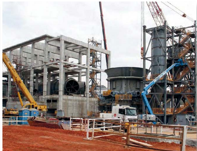
Figure 6: Mechanical and electrical installation for the MVR 6700 C-6 mill at the Barroso plant