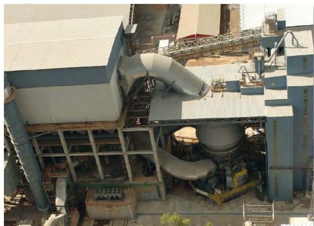
Figure 7: View of the completed MVR 6700 C-6 mill