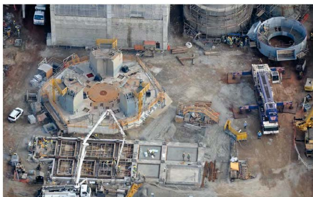
Figure 5: Civil works at the Barroso plant in Brazil