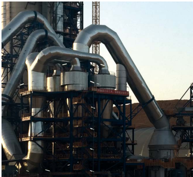
Figure 4: MVR 6000 R-6 mill for raw material grinding, Algeria

A second MVR mill of the type MVR 6700 C-6 is installed in Northern Africa. The mill has been in operation since April