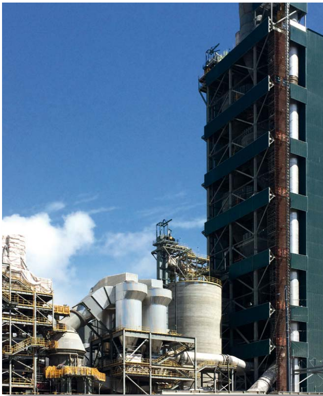
Figure 3: View of the MVR 5000 R-4 mill, North America

Over the last years, many modular vertical roller mills have been put into operation all over the world. For raw material grinding Table 3 shows the exemplary operational results for an MVR mill with a grinding table diameter of 6 m and six grinding rollers. Fig. 4 shows views of the modular MVR mill arrangement.