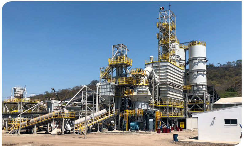
Above: Modular ready2grind systems are installed around the world. Here is an MVR 2500 C-4 in Costa Rica.

Another exciting digital topic we are working on is artificial intelligence (AI), because we want to use this technology to optimise mill operations. The benefits of AI are clear. A skilled human operator can certainly set several operating parameters and overlook the interaction of these. With the help of artificial intelligence, you can have any number of