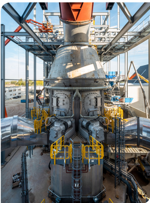
Below: The largest mill in Western Europe, an MVR 5300 C-6 in Belgium, is equipped with GPpro.

PH: I can only speak for our own ready2grind system