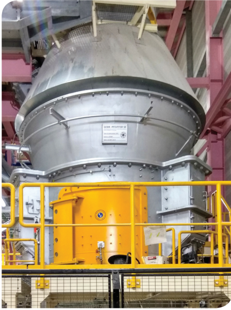
Above: MPS 225 B grinding-drying mill for natural and recycled gypsum.

Capacity = 75t/hr Fineness = <10% R 0.150mm Power = 800kW Surface moisture (feed) = 8% Surface moisture (prod) <0.1%