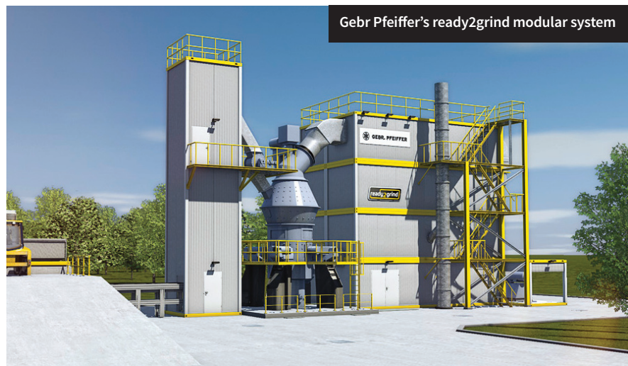
Gebr Pfeiffer's ready2grind modular system

Among the first ready2grind installations is an order for LafargeHolcim Colombia. This new cement grinding plant will comprise the clinker feed modular hopper system, Gebr Pfeiffer's ready2grind milling circuit and product storage, plus a packing plant by Claudius Peters.