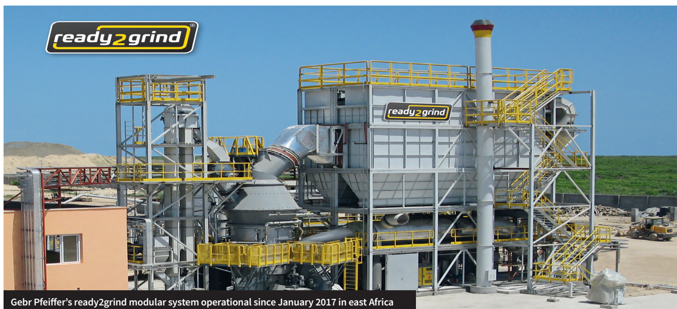
Gebr Pfeiffer's ready2grind modular system operational since January 2017 in east Africa

The modular design allows for the efficient transport and erection of the grinding plant. Its standard shipping container